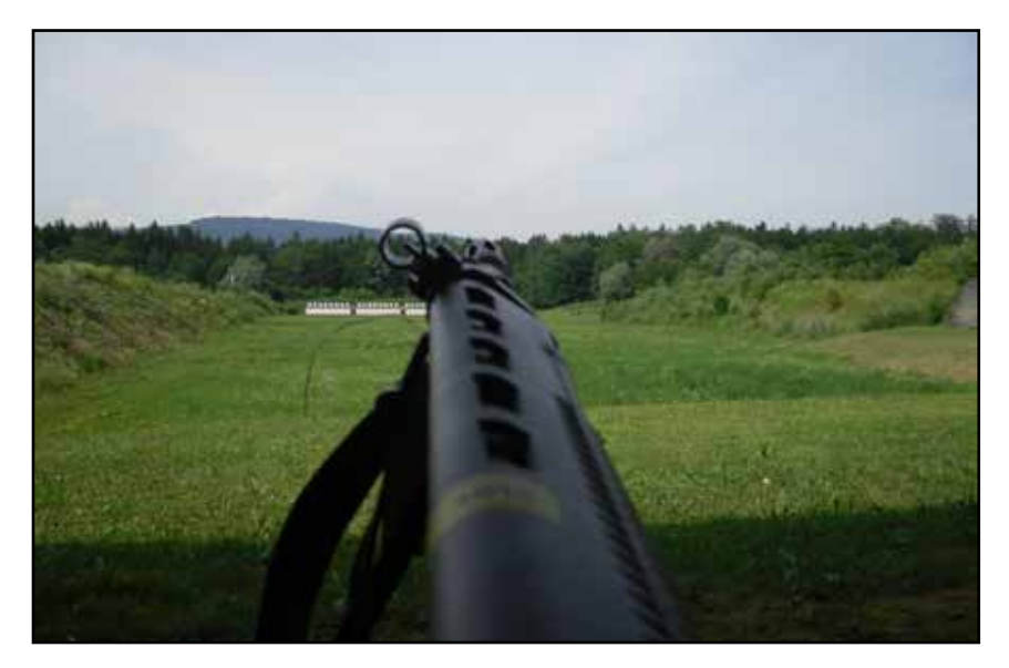
A Stgw 90 service rifle points downrange at 300 meters. Firing stopped when a hirsch wandered across the range. Aarau 2010.

I shot pistol that morning, beginning with two events at 25 meters. In the Duell, a light flashes on, you raise the pistol and shoot once within 3 seconds; pause and repeat for five shots; then shoot the same string again. In the Series, you shoot five rounds in 30 seconds, then repeat.