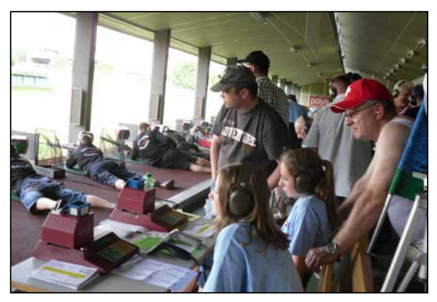
Rifle shooting in prone position at the firing line. Note the youngsters behind them keeping score for tips. Aarau 2010.

Another two pistol events at 50 meters: the Military, 4 slow fire, then 4 shots in 60 seconds; and the Veteran (born in or before 1950)-5 slow fire.