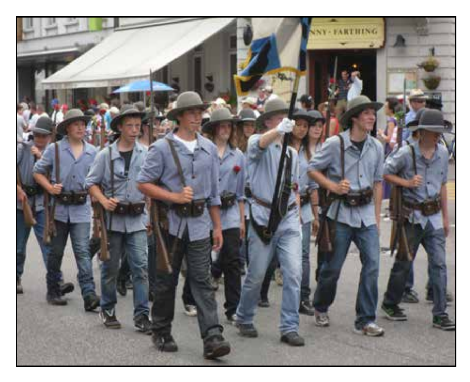
The girls and boys of the Lenzburg Cadets march with their .22 rifles. Aarau 2010.

from Roman and medieval to Sonderbund War and World War II—and farmers, vintners, politicians, and every manner of shooting teams of today. Our Swiss Rifles club marched behind an American WWII jeep with a 5-year old boy in a general's hat!