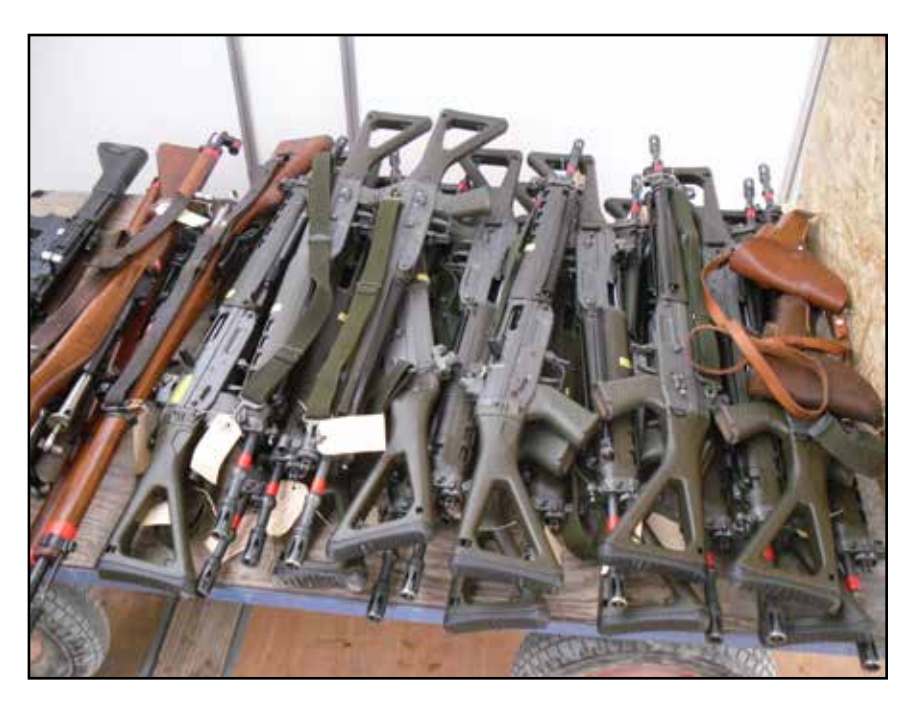
Rifles and pistols issued to the Swiss Rifles of Washington, D.C. Aarau 2010.

All this time, I am shooting for score, but my sights are set way too low and are being adjusted upwards ever so conservatively. Had to aim so high and cover the bullseye with the front sight that it is hard to see the center! It's taking forever to adjust the sights to go higher.